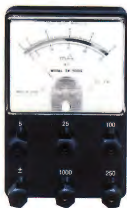
SK-5000 AC Milliammeter

☆ Usable for School teaching materials or Factory Line