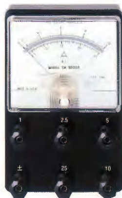
SK-5000A AC Ammeter