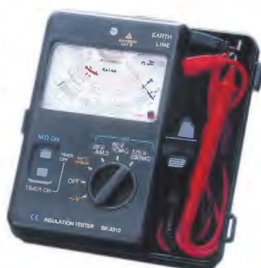
Triple Rated SK-3310