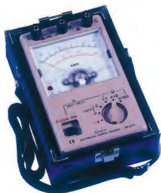
SK-3710 CE Automatic Earth Tester