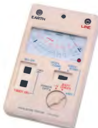
Double Rated SK-3002