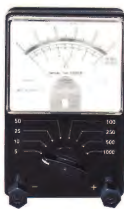
SK-5000B AC Voltmeter