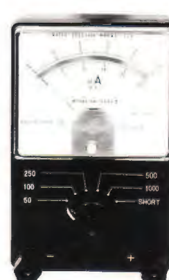
SK-5000C DC Microammeter