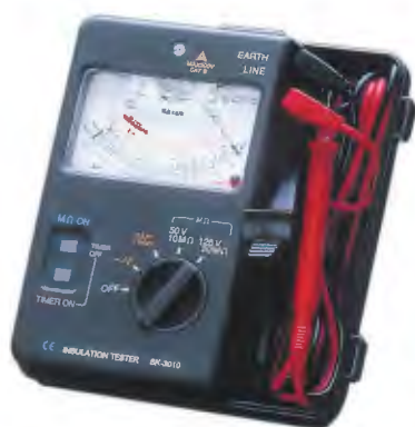
Double Rated SK-3010