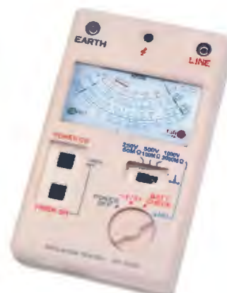
Triple Rated SK-3020